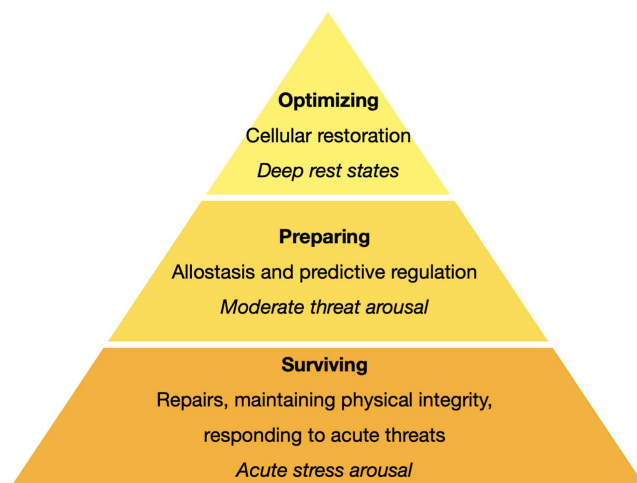
Figure 3 Hierarchy of Biological Functions Based on Contextual Demands and States of Arousal

Note. This figure represents a hierarchy of biological needs that depends on energy resources deployed among cells and across the body. At the bottom of the hierarchy are basic needs for surviving in the present moment, such as repairing acute damage (e.g., proteins) and maintaining physical integrity (e.g., membrane potential), as well as responding to acute threats. Once those needs are met, then the organism can devote energy toward the next level of need—preparing for coming environmental demands; this process is also termed predictive regulation or allostasis (Bobba-Alves, Juster, & Picard, 2022). If this level does not consume all energy resources, then energy can finally be used toward optimizing. In other words, once cellular and physiological systems are working well, and there are no threats to take care of or plan for, then energy is directed toward cellular restoration. Each level of the hierarchy is associated with a different allostatic state, as indicated in the figure with italicized text. See the online article for the color version of this figure.